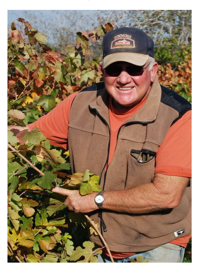
AGRICULTURAL CROP & LIVESTOCK REPORT