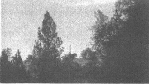
Verizon 19850.JPG 1146K