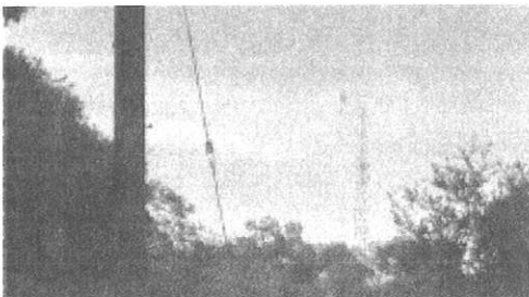
Verizon 19635.JPG 1159K