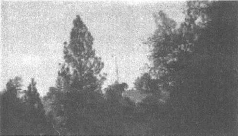
Verizon 19850-2.JPG 1147K