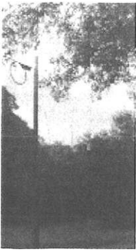
Verizon 19635-2.JPG 1069K