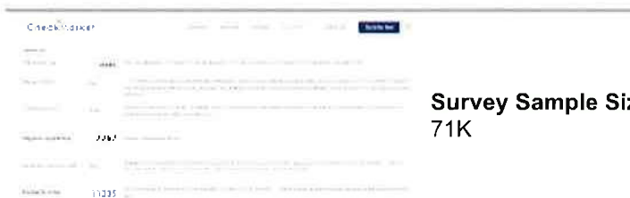
Survey Sample Size.PNG 71K