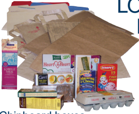
Chipboard boxes, paper products, cartons

PLACE RECYCLABLES IN BAGS AND TIE ENDS SECURELY LOOSE CARDBOARD MUST BE PLACED INSIDE THE CART