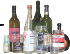
Empty glass containers