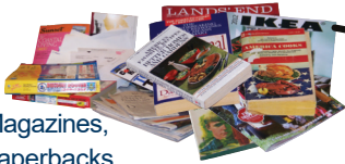
Magazines, paperbacks, junk mail