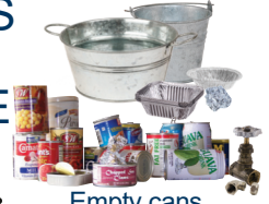
Empty cans, small metal items