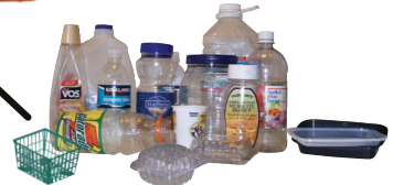
Empty plastic containers, small plastic items